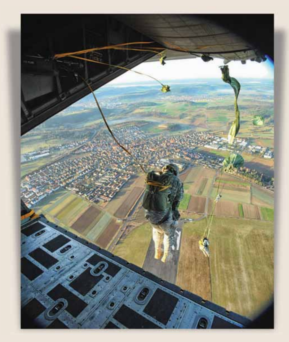
"Jumping out of a perfectly good aircraft" Malmsheim, Germany