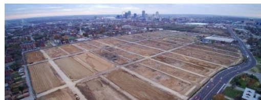
Future NGA West Headquarters site, 22 Sep 17

Force was acquiring for exclusive development and operation by the NGA and for the Air Force property from which the NGA was moving its Western Headquarters. In addition, AFLOA/JACE advised clients about environmental compliance and restoration requirements for the new headquarters site. AFLOA/JACE worked with engineers and attorneys within the Air Force Secretariat and in multiple Department of Defense organizations, as well as with state and local authorities, to identify and negotiate resolution of environmental contamination and remediation issues. AFLOA/JACE resolved matters such as: 1) how clean the property would be when transferred to the Air Force; 2) management of soils excavated during