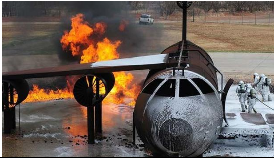
Air Force firefighting training

construction activities at the site; 3) the amount and terms of environmental liability insurance for the parcel, and; 4) the environmental provisions in two-party and multiple-party agreements the Air Force entered into with NGA and subdivisions of the City of St Louis, MO to accomplish the NGA Western Headquarters move.