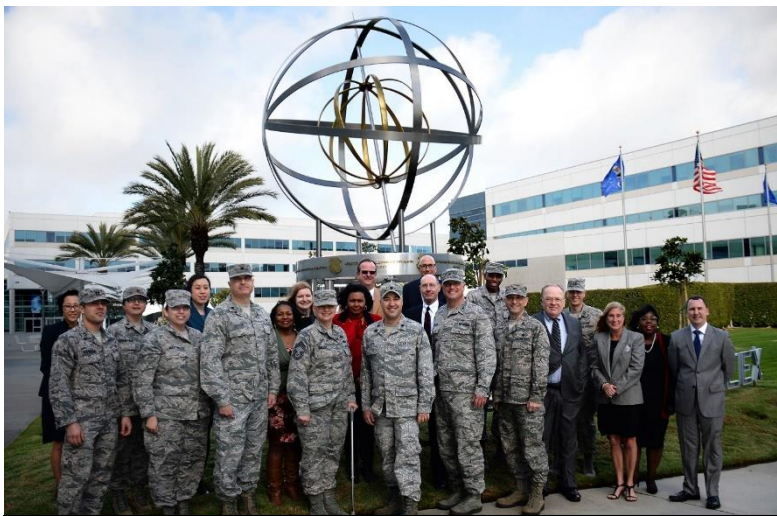
SMC legal personnel on the historic grounds of the Western Development Division, the birthplace of Air Force space power and now the SMC Headquarters.

The 14th Air Force Legal Office (14 AF/JA) and Joint Functional Component Command for Space (JFCC Space) assisted with United States Strategic Command's transition to the Joint Force Space Component Command, furthering Department of Defense's commitment to integrating space in multi-domain operations. 14 AF/JA supported combatant commanders' operations worldwide and integrated into the command's first organic advanced target development capability with hundreds of space-related targets reviewed for compliance with Law of War principles. Our international exercises and experiments with combatant commands and five allied nations have begun to normalize space rules of engagement, lexicon, and the understanding of the continuum of hostilities, among the Department of Defense and our partner nations. The JAG Corps added a full-time joint JAG to support the critical mission of the National Space Defense Center, to protect and defend the space warfighting domain.