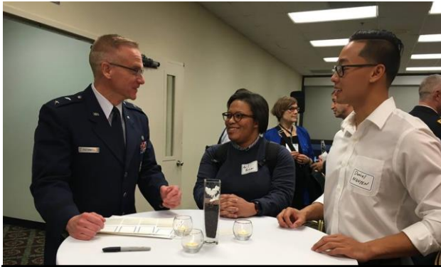
The new Judge Advocate General, Lieutenant General Jeffrey Rockwell participates in a recruiting event at the ABA SCAFL Judge Advocate panel in 2017 while the Deputy Judge Advocate General.

JAG Corps Airmen perform most of their work at legal offices located at Air Force installations and deployed locations around the world. These offices work for commanders and provide legal advice and