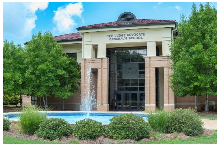
The Air Force Judge Advocate General's School at Maxwell AFB, AL.

The JAG School, located at Maxwell AFB, AL is the educational hub of the Air Force JAG Corps. JAG School faculty directed and taught in 79 resident and online courses over the last year, reaching more than 16,000 students, from both within and outside the JAG Corps.