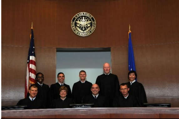
The Judges of the Air Force Court of Criminal Appeals.

The United States Air Force Court of Criminal Appeals is an independent appellate judicial body authorized by Congress and established by The Judge Advocate General pursuant to his exclusive authority under Article 66(a), Uniform Code of Military Justice (UCMJ), 10 USC § 866(a). The Court has jurisdiction over: (1) trials by court-martial where the sentence includes confinement for 12 months or longer, a punitive discharge, or death; (2) cases forwarded for review by The Judge Advocate General under Article 69(d), UCMJ, 10 USC § 869(d); (3) certain government appeals of orders or rulings of military trial judges, pursuant to Article 62(a), UCMJ, 10 USC §862(a); (4) petitions for new trial referred by The Judge Advocate General pursuant to Article 73, UCMJ,