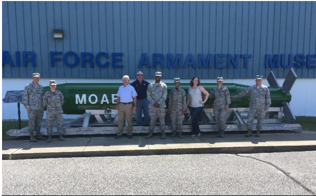
Eglin AFB attorneys and paralegals stand next to the GBU-43/B Massive Ordnance Air Blast display at the Air Force Armament Museum. Developed at Eglin AFB, the "MOAB" was first deployed against an Islamic State tunnel complex in Afghanistan on 13 April 2017.