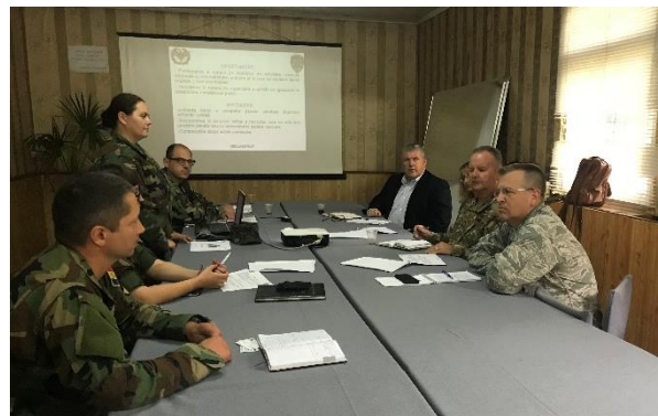
DIILS trip to Moldova

In June, USAFE-AFAFRICA participated in a Defense Institute for International Legal Studies (DIILS) Defense Institution Building assessment in Moldova. The trip included engagements with Moldovan Legal Advisors from their Ministry of Defense as well as trips to visit two military installations to meet with the commanding officers and their embedded legal advisors. This assessment will result in an After Action Report and a recommended future engagement plan with Moldova. In addition to this assessment, over the past year, attorneys from our wings have participated in DIILS International Humanitarian Law training events in Estonia and Niger.