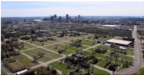
Future NGA West Headquarters site, 17 Mar 16

The Environmental Law and Litigation Division works to preserve and protect air, land, and other precious natural and cultural resources central to the successful performance of the Air Force Mission. AFLOA/JACE helps Air Force clients comply with environmental laws, seeks resolution of environmental issues impacting the mission, and defends the Air Force against legal challenges that threaten mission accomplishment. Additionally, AFLOA/JACE handles rate cases, renewable energy issues, and utility contracting.