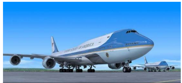
Rendering of new Air Force One

The new Air Force One provides the airborne command post for the Commander-in-Chief. When the Air Force evaluated the capability of Joint Base Andrews to support the new Air Force One aircraft, AFLOA/JACE supported completion of the Environmental Impact Statement and development of the first Air Force wetlands mitigation bank to compensate for lost wetlands on base. Using an innovative combination of federal authorities to acquire land and manage natural resources, AFLOA/JACE teamed with other Air Force professionals to conserve and establish a regulated wetlands bank off base to avoid mission restraints and pave the way for timely arrival of the new Air Force One and other actions on Joint Base Andrews, MD.