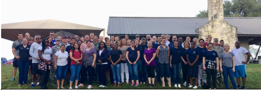
AF legal personnel from the four legal office within the 502d Air Base Wing held their 2d Annual Turkey Bowl at Joint Base San Antonio-Lackland. With over 110 members, they are the largest legal community in one Wing.

JBSA-Randolph legal office handled a huge spike in legal assistance clients. They were also very active