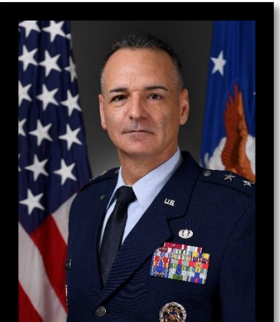
Maj Gen Charles L. Plummer Deputy Judge Advocate General