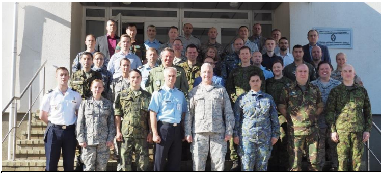
Participants in the Lithuanian TTX

In May, USAFE-AFAFRICA attorneys and paralegals, under the European Deterrence Initiative, worked hand-in-hand with Lithuanian armed forces to hold a table top exercise (TTX) with 40 participants (operators and legal advisors) from 12 European nations. The TTX included a multi-day scenario on the legal and technical issues involved in coalition operations outside of the NATO context (e.g., attribution in cyberattacks, information sharing, international agreements and energy