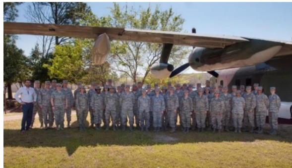
JAO supports the advanced law of war education of judge advocates, ensuring the foundational legal theory and practical application of the law of war is shared with operational JAGs

Manual on the International Law of Military Space Operations, and continued efforts with the Manual on International Law Applicable to Military Uses of Outer Space (MILAMOS), both at the cutting edge of academic and practical analysis of emerging legal operations issues. Spearheaded by international academic institutions, these space law manuals reflect the positions of experts from around the world and have the potential to influence global perceptions towards military operations in space. JAG Corps participation ensures Air Force legal experts have a voice in shaping the international discourse while simultaneously strengthening Air Force links to the international space law community.