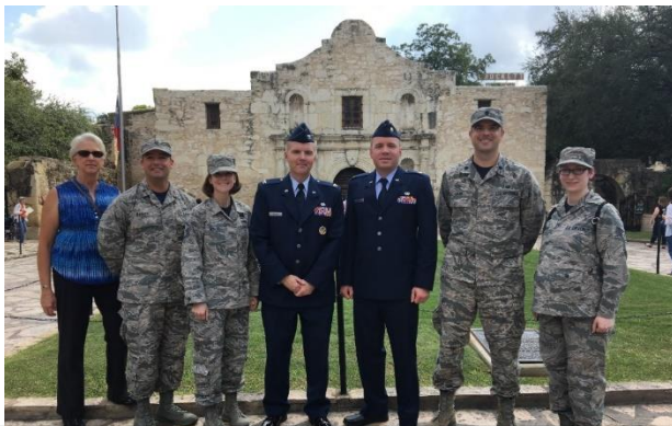
25th Air Force personnel following a promotion ceremony held at the Alamo in San Antonio, Texas.

In 2017-2018, 25th Air Force (25 AF/JA) legal professionals delivered essential support to the Air Force's global intelligence, surveillance, and reconnaissance (ISR) enterprise. 25 AF/JA solved key legal gaps in modernizing intelligence collection in order for