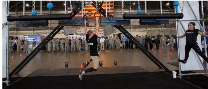
AFSVA Legal Office helped deliver essential fitness and recreation opportunities to more than 80 installations, and countless Airmen.

The Air Force Services Activity Legal Office (AFSVA/JA) is a small, yet full service shop under the Air Force Installation and Mission Support Center, which provides comprehensive legal support relating to nonappropriated funds (NAF), Air Force-wide. AFSVA strives to deliver Morale, Welfare, and Recreation (MWR) support to Airmen all over the world, making AFSVA legal professionals responsible for a litany of unique practice areas in personnel, child care, lodging, commercial sponsorships, and franchising. As a function of the AFSVA