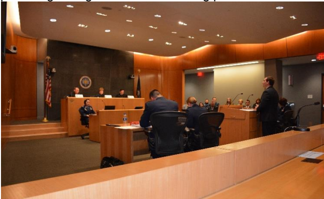
Penn State Law student presents amicus oral argument before the Air Force Court of Criminal Appeals during the Court's Project Outreach at Penn State.

Since January 2017, the Court has rendered over 360 decisions, including 27 published opinions providing new guidance and binding precedent in all Air Force courts-martial. The Court also heard oral