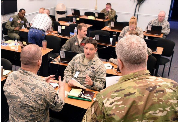
AF legal personnel provide joint training to the 9 AF HQ staff as well as hundreds of Airmen deploying to the USCENTCOM AOR.

In support of the Chief of Staff of the Air Force priority number two, Headquarters 9th Air Force (9 AF)