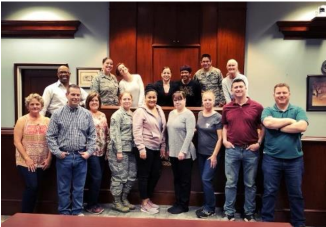
In March 2018, JAT in coordination with the Air Force Judge Advocate School created and held the first of a quarterly court reporter course

This 5-day event provided the trial judiciary the opportunity for circuits to foster professionalism while also offering instruction on such areas as new statutes and rules related to sexual offenses, sentencing considerations, digital evidence, and recent appellate cases. Additionally, 1 January 2018 marked full implementation of mandatory e-filing across the Air Force. The e-file site replaced the ad hoc system of “filing” court-martial documents via e-mail and is the precursor to public filing. It provides a reliable source from which all pleadings, responses and orders are accessible.