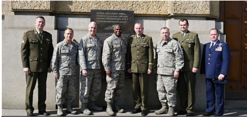
Group photo from the Czech Republic Air Targeting Symposium

A primary method of furthering these priorities is through legal engagements with our European partners. In April, USAFE-AFAFRICA attorneys partnered with Texas Air National Guard attorneys under the State Partnership Program to conduct an Air Targeting Symposium for the Czech Republic Air Force. The training focused on the Law of Armed Conflict and rules of engagement and included both Czech AF legal advisors and Czech AF Commanders.