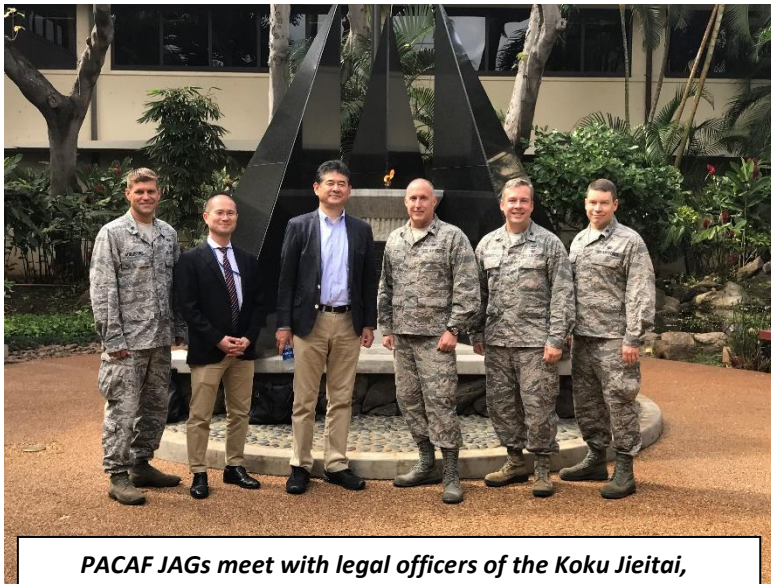
PACAF JAGs meet with legal officers of the Koku Jieitai, Japan's Air Self Defense Force.

Pacific Air Forces (PACAF) delivers rapid and precise air, space and cyberspace capabilities to protect