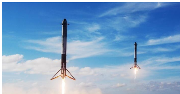
SpaceX synchronized booster landing after the first Falcon Heavy launch.

Additionally, due to 24 AF's cutting-edge mission, 24 AF JAGs are also uniquely positioned to support Secretary of Defense's National Defense Strategy objectives to reform the Department of