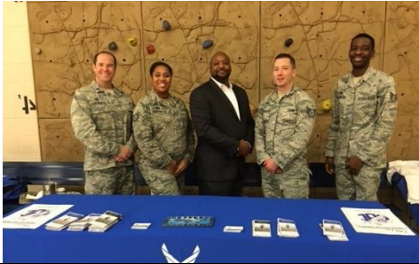
Office of Airmen's Counsel attorneys and paralegals participating in wounded warrior outreach event in San Antonio, Texas.

In 2017, the Office of Airmen's Counsel (AFLOA/CLSA) represented 1,825 ill, injured, or wounded Airmen facing potential separation through the Air Force Disability Evaluation System. In addition to providing direct legal support to clients, AFLOA/CLSA focused its efforts on three major initiatives. First, AFLOA/CLSA partnered with AFLOA's Legal Information Services Directorate to design and field the OAC's first-ever case management system. Second, on 1 March 2017, AFLOA/CLSA tackled a massive backlog of over 350 disability cases by increasing its weekly productivity by 50% - 100% for 15 consecutive months. By 31 May 2018, the Division eliminated the backlog of cases at the Air Force Formal Physical Evaluation Board. Third, AFLOA/CLSA teamed with the Air Force Wounded Warrior Program and Headquarters Air Force Special Operations Command to conduct outreach at wounded warrior events