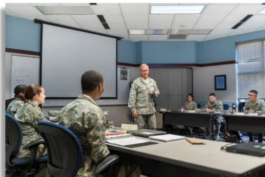
The Judge Advocate General speaks with students in the Paralegal Apprenticeship Course

worldwide JAG Corps personnel and is responsible for the administration of military justice, civil law and litigation. AFLOA leadership supervise senior trial counsel (senior prosecutors), defense counsel, special victims' counsel, and appellate counsel. AFLOA oversees field support centers, civil litigation counsel, The Judge Advocate General's School (JAG School) at Maxwell Air Force Base (AFB), AL, and the Legal Information Services Directorate. The headquarters staff, along with the members of AFLOA, provide strategic planning and resource management, litigation expertise in military justice and civil law, and offer extensive education and training to the field. This report features some of their diverse missions.