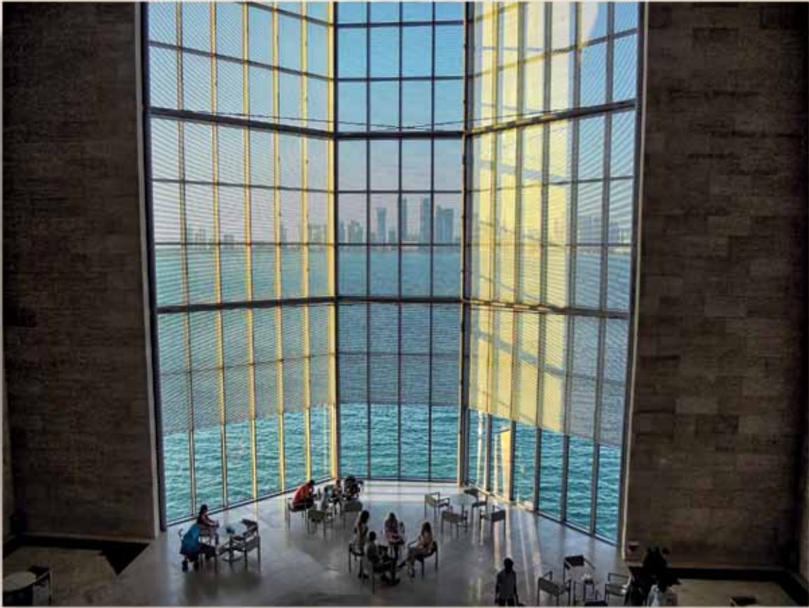
Museum of Islamic Art, Doha, Qatar