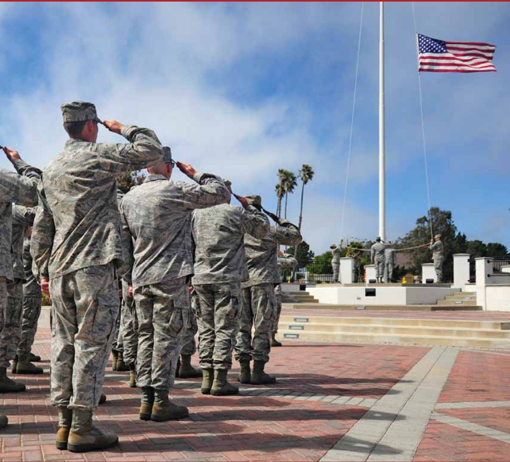
Retreat ceremony - Spice paraphernalia

AFJAGS PRESS THE JUDGE ADVOCATE GENERAL'S SCHOOL 150 CHENNAULT CIRCLE MAXWELL AFB, AL 36112-6418